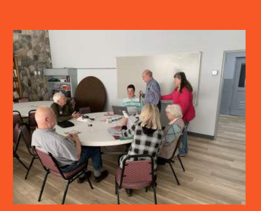
Technology Offered for Your Situation (TOYS)